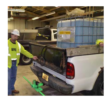
Parking lot equipment example