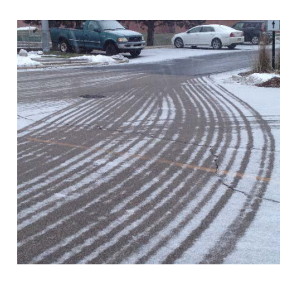
Wet/dry spread pattern example