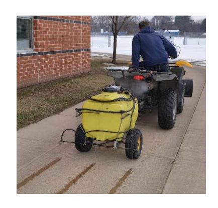
Wet/dry spread pattern equipment example; make double pass to get more lines